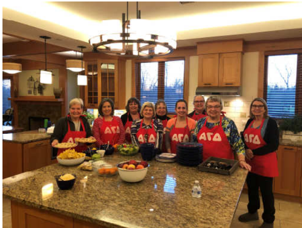
The Crew at Ronald McDonald House Feb. 2020 Week of Service