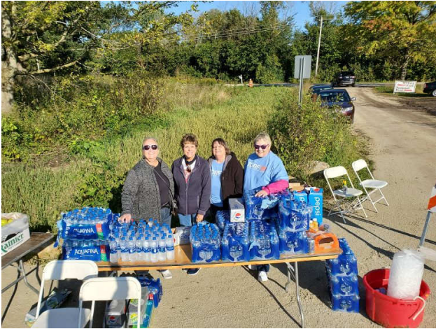
DuPage at JDRF Walk, Fall 2019